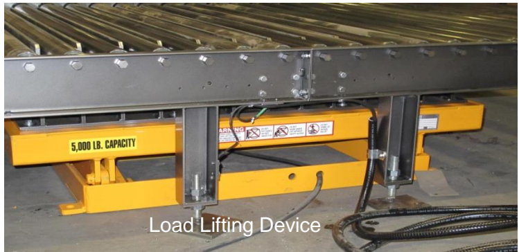
Load Lifting Device

← We have worked with most major palletizer manufacturers to integrate an in-line fully automated wrapping system.