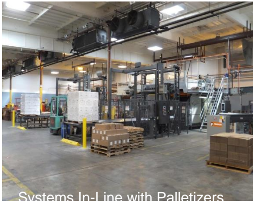
Systems In-Line with Palletizers

Cousins Packaging can design a stand-alone machine or complete engineered material handling system to meet your specific requirements. We manufacture our own conveyors in-house so that your entire system is designed, built and tested at our facility.