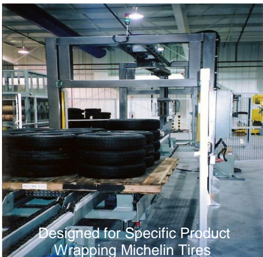
Designed for Specific Product Wrapping Michelin Tires

↗ We can provide specialty material handling equipment