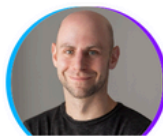
Adam Grant, PhD Organizational Psychologist and New York Times Bestselling Author