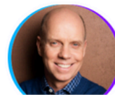
Scott Hamilton Olympic Champion Figure Skater and Cancer Survivor