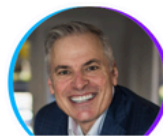
Patrick Lencioni President of The Table Group and Bestselling Author