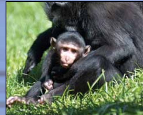
Sulawesi crested macaque (born 2005)