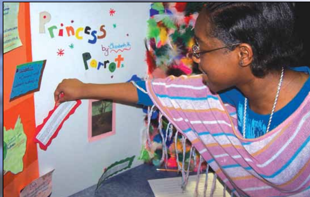
The Mentoring Young Scientists program was launched in 2005.

The volunteer program continued to assist in fulfilling the Zoo's educational and recreational mission. In 2005 alone, 672 individuals volunteered at the Zoo, providing a total of 30,650 hours of service. The economic value of their contribution exceeded $550,000.