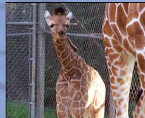
Reticulated giraffe (born 2005)