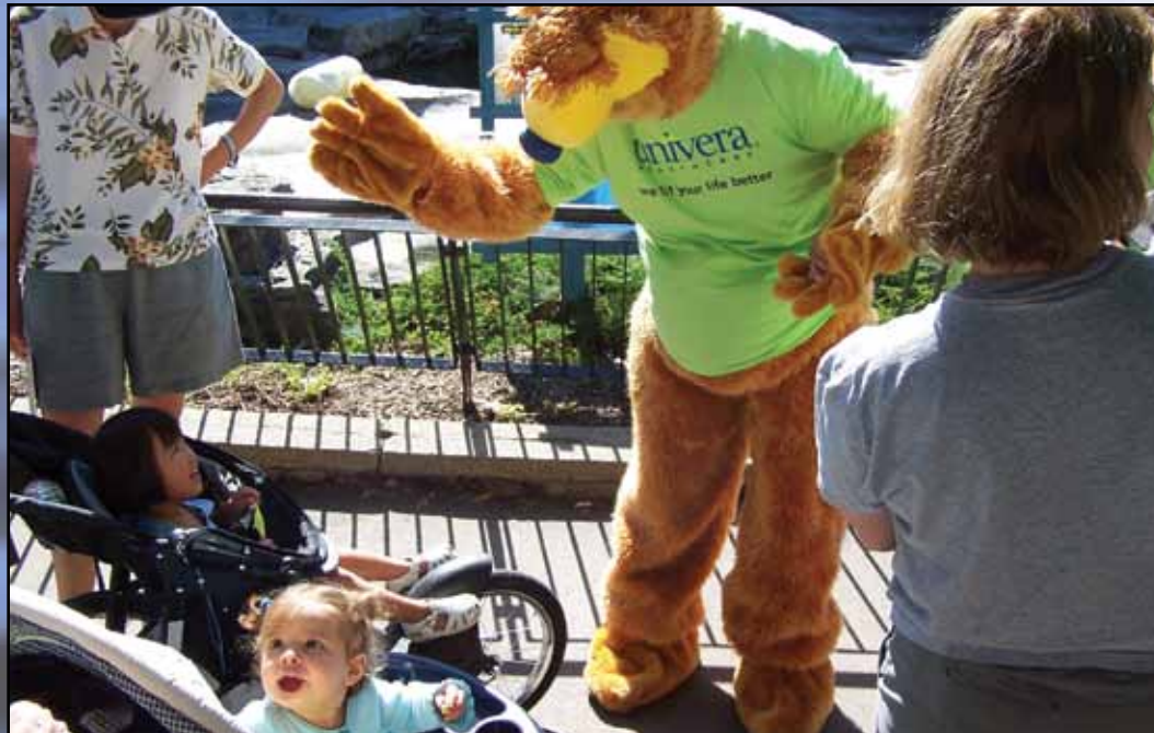
Wild About Wellness Health Fair 2005.

The Buffalo Zoo's three holiday breakfasts, Breakfast with Santa, Breakfast with the Easter Bunny and Mother's Day Brunch were fun ways to celebrate at the Zoo.