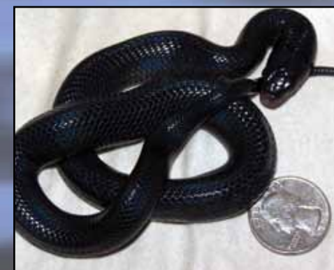
Eastern indigo snake (hatched 2005)