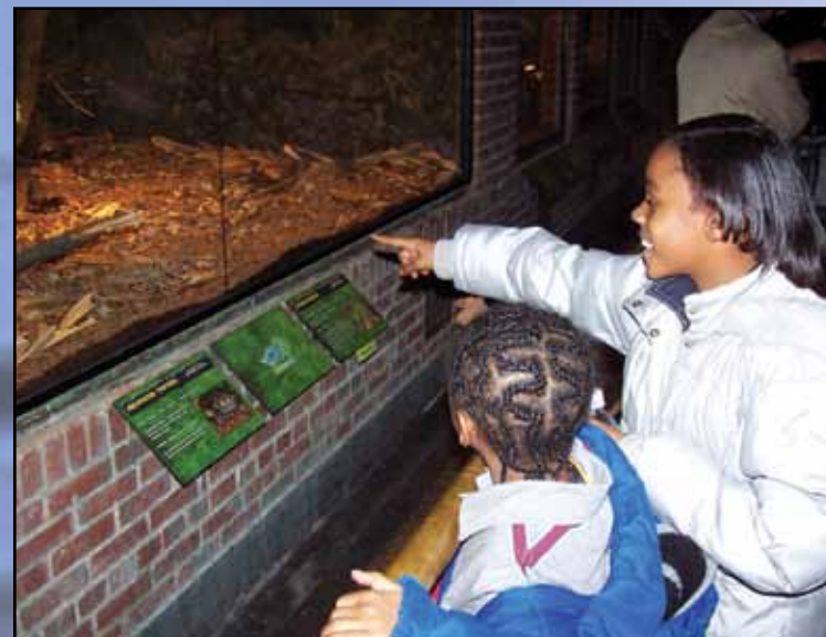
The newly-renovated Reptile House is a big hit with visitors!

Sea Lion Cove, presented by NOCO Energy Corporation, opened to the public on August 6, 2005 and continues to be a hit with Zoo visitors! The exhibit, which is located adjacent to Otter Creek, recreates the California coastline and offers visitors several opportunities to get face-to-face with the Zoo's newest residents, California sea lions Dallas and Pocus. Other exhibit highlights include naturalistic rockwork, saltwater pools and extensive landscaping of indigenous plants. Visitors can observe the sea lions year-round by using the dramatic underwater viewing windows, bridges or state-of-the-art 220-seat amphitheater, which will host daily demonstrations. A variety of interpretive graphics surround the exhibit and serve as educational tools designed to teach visitors about the natural history and ecology of the species. Sea Lion Cove is the fourth exhibit to open as part of the first phase of the Zoo's Master Plan. In addition to fitting nicely with the Zoo's theme of water, the species had been missing from the Zoo for 25 years and was the animal most requested to return to the Zoo during several public meetings leading up to the development of the Master Plan.