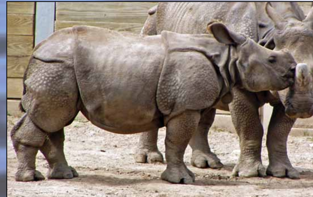
Ashakiran, the Zoo's baby Indian rhino, celebrated her first birthday!

The Buffalo Zoo's baby Indian rhinoceros celebrated her first birthday in September. The Zoo teamed up with Perry's Ice Cream to throw a birthday bash complete with games, prizes, keeper talks and free samples of ice cream!