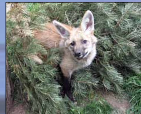
Maned wolf (born 2005)