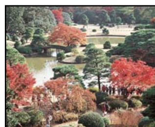
© Tokyo Convention & Visitors Bureau

http://www.gotokyo.org/en/kanko/bunkyo/spot/40860.html