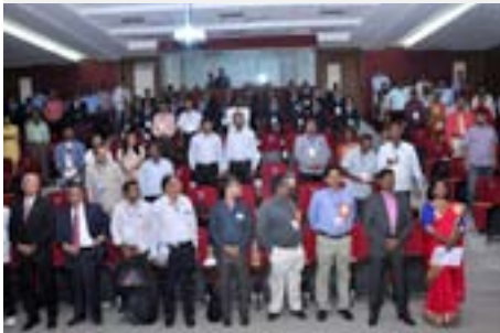
HIM INDIA INFO-2015 Conference Participants