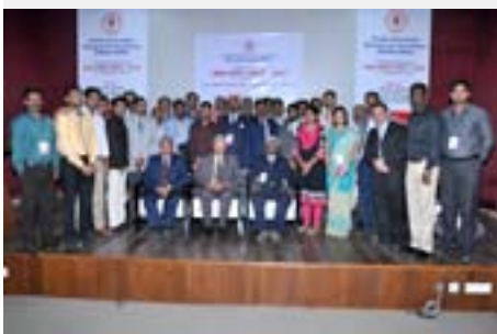
HIMA INDIA Executive Members along with some Conference Speakers