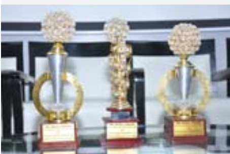
Dr Mogli Award of Professional Excellence for the year 2015

“Mementos” were given to best speakers, as chosen by an Ad hoc committee of 3 members who evaluated the presentation for the latest innovative and practical professional knowledge and skills that informed and motivated the participants.