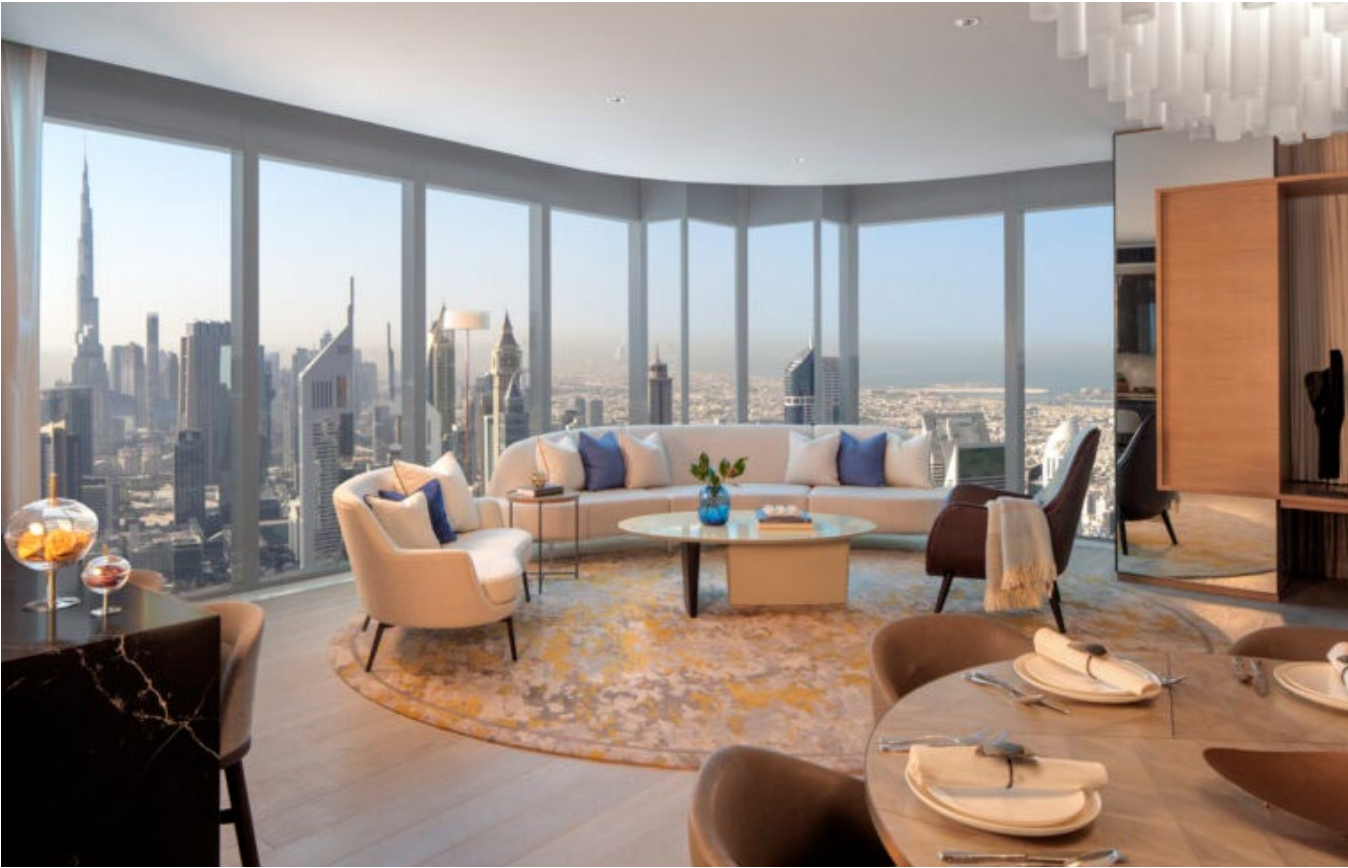
A living room in the One&Only One Za'abeel residences in Dubai

The rise of branded residences in Dubai and beyond