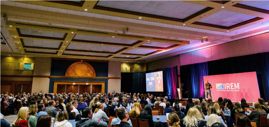
Attendees gather at the 2025 IREM Leadership Forum held in Chicago in November 2025.