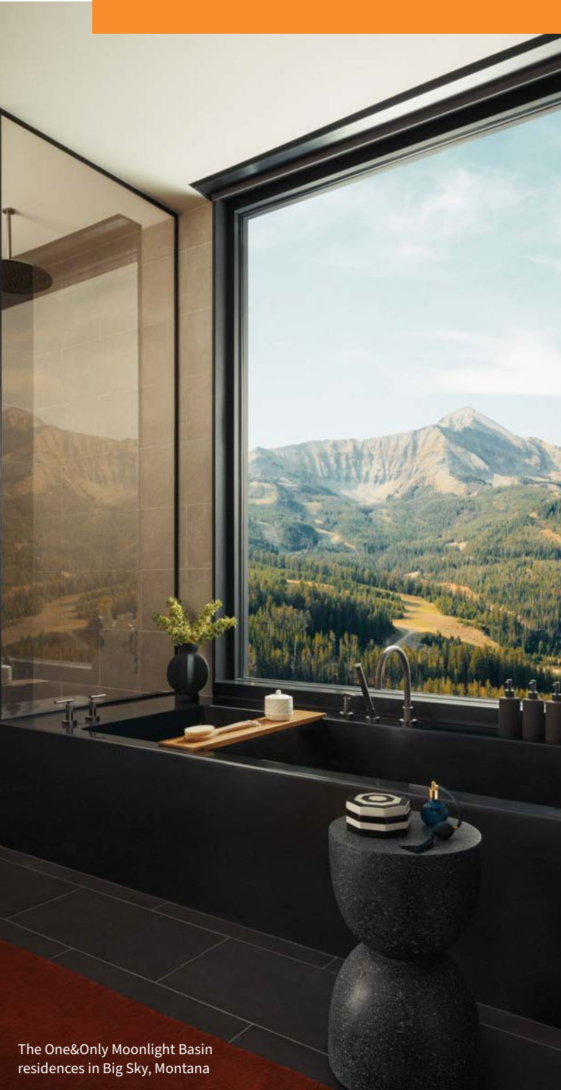
The One&Only Moonlight Basin residences in Big Sky, Montana

Branded residences, at their core, are luxury residential properties under a well-known brand umbrella.