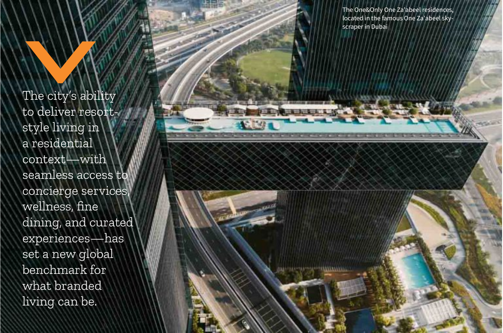
The One&Only One Za’abeel residences, located in the famous One Za’abeel skyscraper in Dubai

Beyond the power of branding, these homes are designed for how people live today—globally mobile, experience-driven, and utilizing cutting-edge conveniences through technology. The appeal of having hotel services, wellness amenities, and even rental management built in is increasingly alluring. ▀