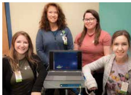
The biofeedback therapy team

symptoms and achieve long-term success. To that end, most patients first undergo an electromyography (EMG) uroflow test, which provides information about activating their pelvic floor muscles and bladder function.