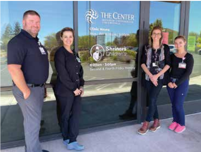
Staff members at the Redmond, Oregon, clinic are ready to welcome patients and families from Central Oregon.