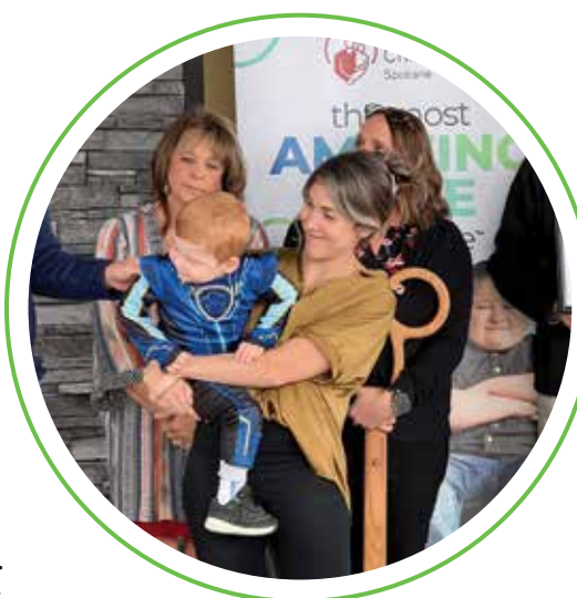
A young patient is intrigued by all the excitement at a ribbon-cutting ceremony for the new Shriners Children's clinic opening in Missoula, Montana.