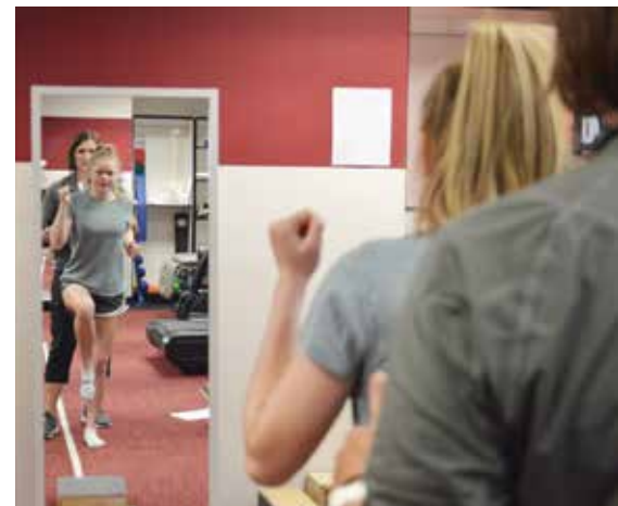
From the sidelines to center court – Shriners Children's sports medicine teams help young athletes return to the games they love.