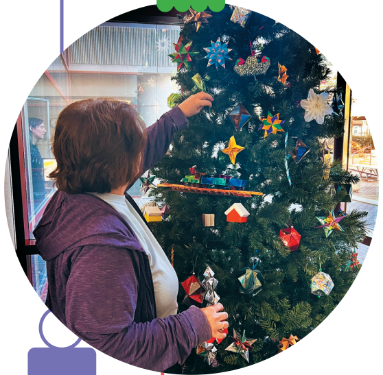
More than three decades' worth of origami ornaments grace the tree at Shriners Children's New England.

The Christmas Tree Farm was a highlight of the season — and all are hopeful the tradition will continue for years to come. 🎄