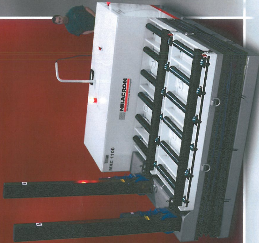
Titan MXC 1100 Cart

Automatic system--operator not required to move molds