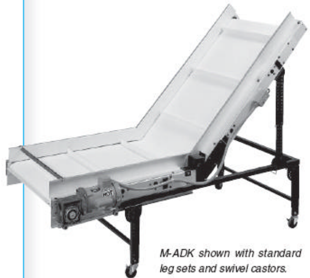
M-ADK shown with standard leg sets and swivel castors.

Weights up to 48% less than comparable models of steel frame conveyors.