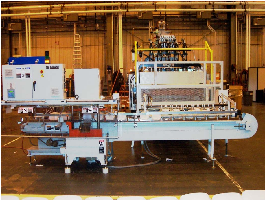
Dual Index Impact Trimmer and VF Drive