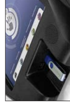
USB key & Ethernet