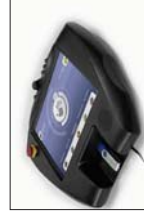
Large, 10" LCD screen