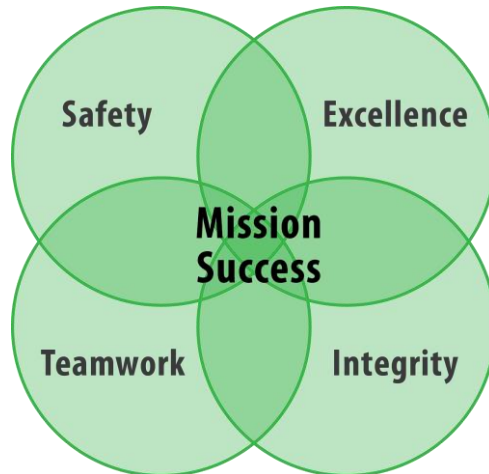
Figure 1: NASA Core Values