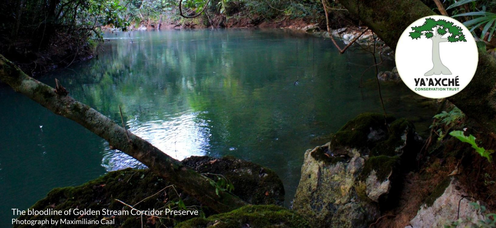
The bloodline of Golden Stream Corridor Preserve