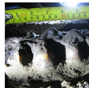
Molar of a prehistoric mammal, Mastadon © Gonzalo Pleitez