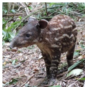
Baby Baird's Tapir strolling on our patrol trail