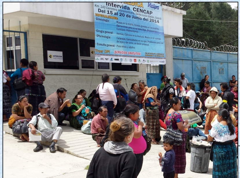
A NAPA-OT Field School student (foreground) gets an overview of patients waiting to schedule surgeries with a jornada in Santa Lucia Uatatlán, Sololá. The field school conducted survey interviews for a project to introduce electronic medical records.

Acceptance to the NAPA-OT Field School is competitive. Anthropology students are especially invited to apply regardless of level, graduate or undergraduate. Applicants are preferred who speak Spanish (intermediate or fluent preferred), have a passion for human rights and social justice, and are ready for an intensive training and immersion.