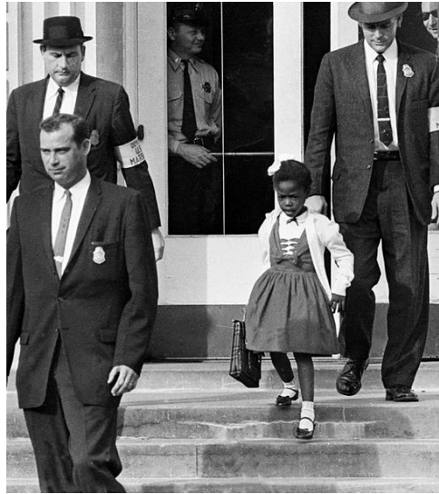
US Marshals with Young Ruby Bridges on School Steps