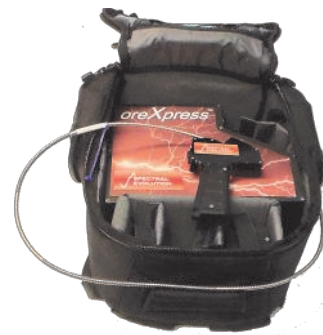
oreXpress and oreXpress Platinum spectrometers are used to identify clay minerals in the field and core shack.

oreXpress, oreXpress Platinum and EZ-ID software are trademarks of Spectral Evolution, Inc. SpecMIN is a trademark of Spectral International, Inc.