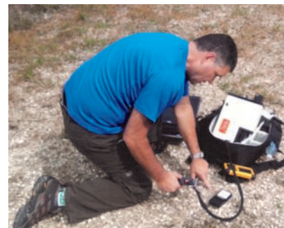
The PSR Series of field portable spectroradiometers is well-suited for scanning for dolomite.

Our EZ-ID sample identification software allows researchers to identify samples by comparing them against an existing library of known samples. The Custom Library Builder module allows a researcher to build a specific library of samples that can then be matched to new targets. Different libraries can be quickly built and used for different applications or environments.