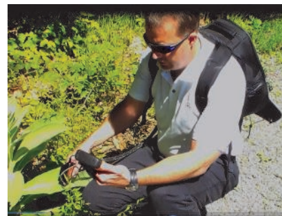
A field portable spectroradiometer provides valuable information for forest canopy research.

Plus a range of accessories including contact probe, pistol grip probe, benchtop reflectance probe with soil compactor, leaf clip, and more.