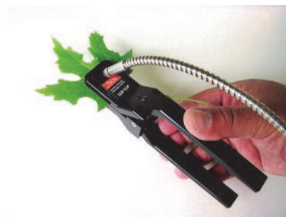
An optional leaf clip includes an internal reference standard.