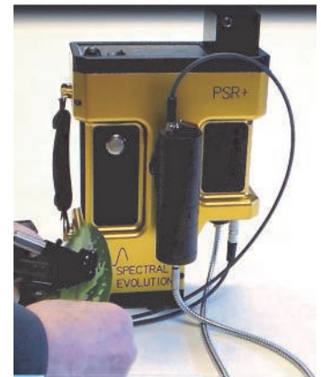
The PSR+ field spectroradiometer and leaf clip can be used to measure water content in leaves.

An optional GETAC PDA has a digital camera and GPS and tags photos, coordinates, voice notes and altimeter readings to your scans.