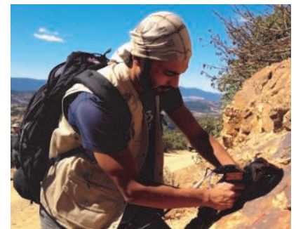
oreXpress in the field.

1 Canal Street ◆ Unit B1 Lawrence, MA 01840 USA Tel: 978 687-1833 ◆ Fax: 978 945-0372 Email: sales@spectralevolution.com www.spectralevolution.com