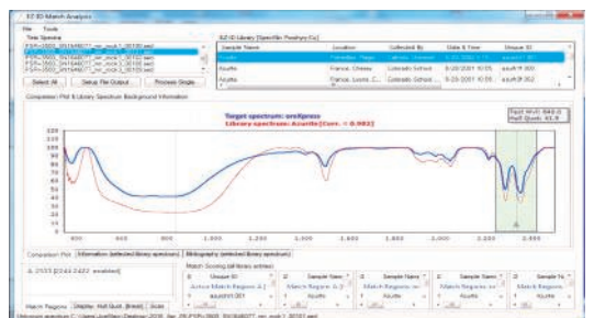
Azurite is a pathfinder mineral for copper