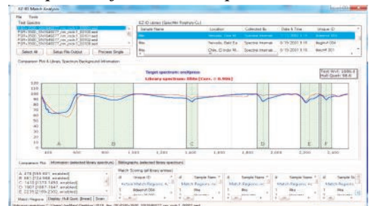
Illite clay common near porphyry copper