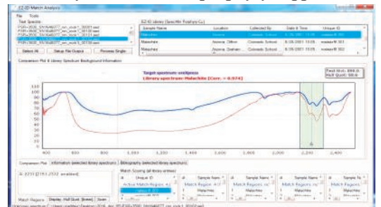
Malachite a secondary copper mineral