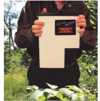
The PSR-3500 field portable spectroradiometer for remote sensing includes access to 19 vegetation indices

Applications can include: vegetation dynamics, plant phenological changes, biomass production , measurement of canopy greening, soil moisture, pasture condition, range land changes, estimation of crop yields, carbon influx or sequestration, plant photosynthesis, leaf area index (LAI) measurement, land cover classification, and more.