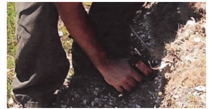
Soil analysis using NIR spectroscopy can measure water, carbon, nitrogen, clay, pH, and organic matter.

In addition to measuring nitrogen content, other soil analysis applications can include: topsoil fertility, erosion risk, hydraulic properties, soil degradation, total organic carbon, organic matter in soil, CEC, and indirect measurement of soil pH.