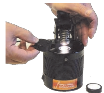
An optional benchtop contact probe with sample soil compactor is useful for lab-based measurements.

1 Canal Street ♦ Unit B1 Lawrence, MA 01840 USA Tel: 978 687-1833 ♦ Fax: 978 945-0372 Email: sales@spectralevolution.com www.spectralevolution.com