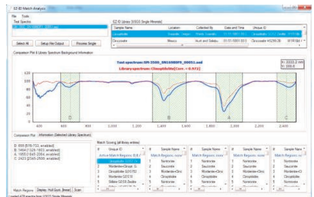
Identifying the mineral clinoptilolite using Spectral Evolution's EZ-ID software.

oreXpress and EZ-ID software are trademarks of Spectral Evolution, Inc.