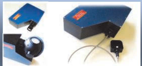
SM-3500 with included foreoptic , optional integrating sphere and fiber optic & right angle diffuser