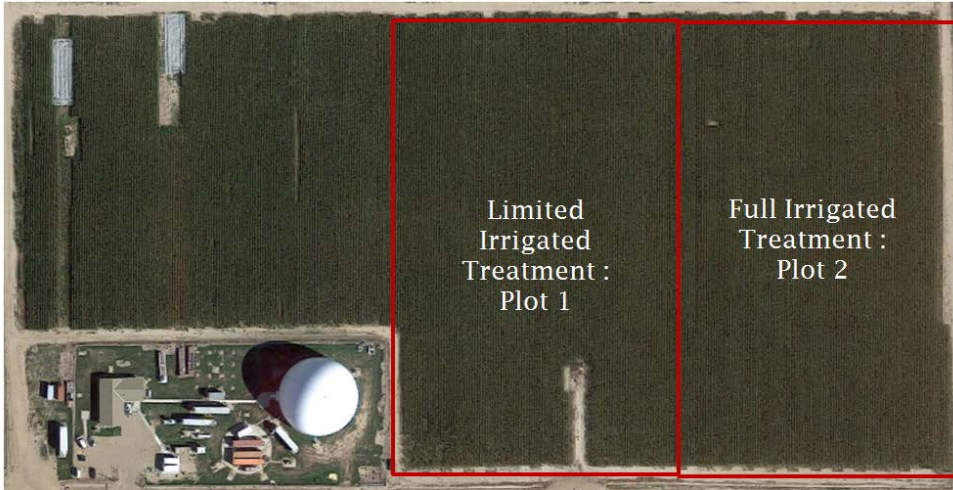
Figure 1. Research fields at USDA ARS LIRF near Greeley, CO.

Corn variety was Dekalb 51-20. It was planted late on June 2 nd of 2017. Emergence occurred around June 8 th . Effective full cover was attained around August 9 th for TrT2 and August 15 th for TrT1.