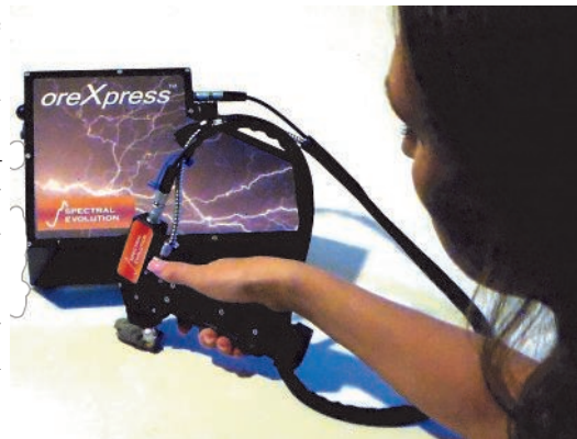
The oreXpress can use a 3mm or 10mm contact probe or a benchtop probe with compactor for chips and powder samples.

And for projects that require higher resolution scans to discover more absorption features, there's the SR-6500 ultra-high resolution field and lab spectrometer.