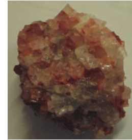
Potash ore sample.

Potassium is a key ingredient in soil fertilizer that improves soil nutrient values, water retention and disease resistance in agricultural crops. Potash ore is the source for potassium in fertilizer and is associated with the minerals sylvite, carnallite, halite, kainite and anhydrite. Potash is mined from sub-surface deposits by conventional shaft mining techniques.