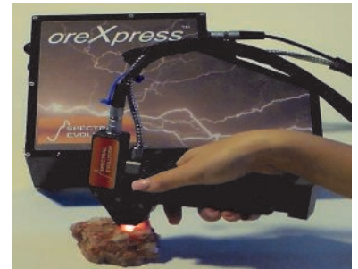
The oreXpress with the Miniprobe's 3mm spot size for field or core shack use.

oreXpress, and EZ-ID software are trademarks of Spectral Evolution, Inc.